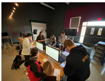
Occtech students labeling and preparing iPads for all of our students.

It is important your family attend one of the parent nights as we highlight the ETO initiative, provide information on the rollout and expectations of the devices, and answer any questions you may have. This is an exciting opportunity for our students and we look forward to navigating the ETO journey together.